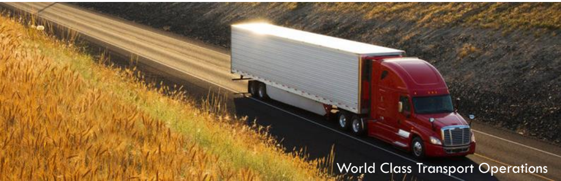
World Class Transport Operations